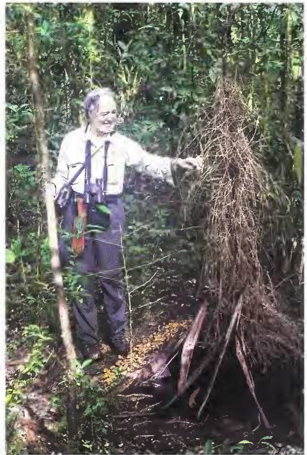
Figure 2. Bower of Vogelkop Bowerbird Amblyornis inornata , Central Kumawa, New Guinea, March 2013; note the tower of sticks glued together, the four Pandanus leaves propped against the tower's base, and (at JD's feet) the rectangular row of pieces of buff-coloured clay

This paper describes our four surveys: one of the Fakfak Mountains (by JD in 1981) and three of the Kumawa Mountains (two by JD in 1983, and one by JD & KDB in 2013). In 2013 we reached the highest Kumawa summit, while in 1981 JD reached an elevation c.85 m below the highest Fakfak summit. Subsequent to Diamond's 1981 Fakfak survey, Gibbs (1994) and Rheindt (2012) surveyed Fakfak birds in 1992 and in 2008 and 2009 respectively. In Table 1 we list all 283 bird species recorded from the Fakfak and Kumawa Peninsulas, as well as presenting notes on 71 species of interest, and offer a preliminary biogeographic discussion of the avifaunas.